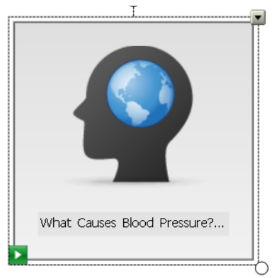
This icon represents a manipulative file from the SMART Learning Marketplace.